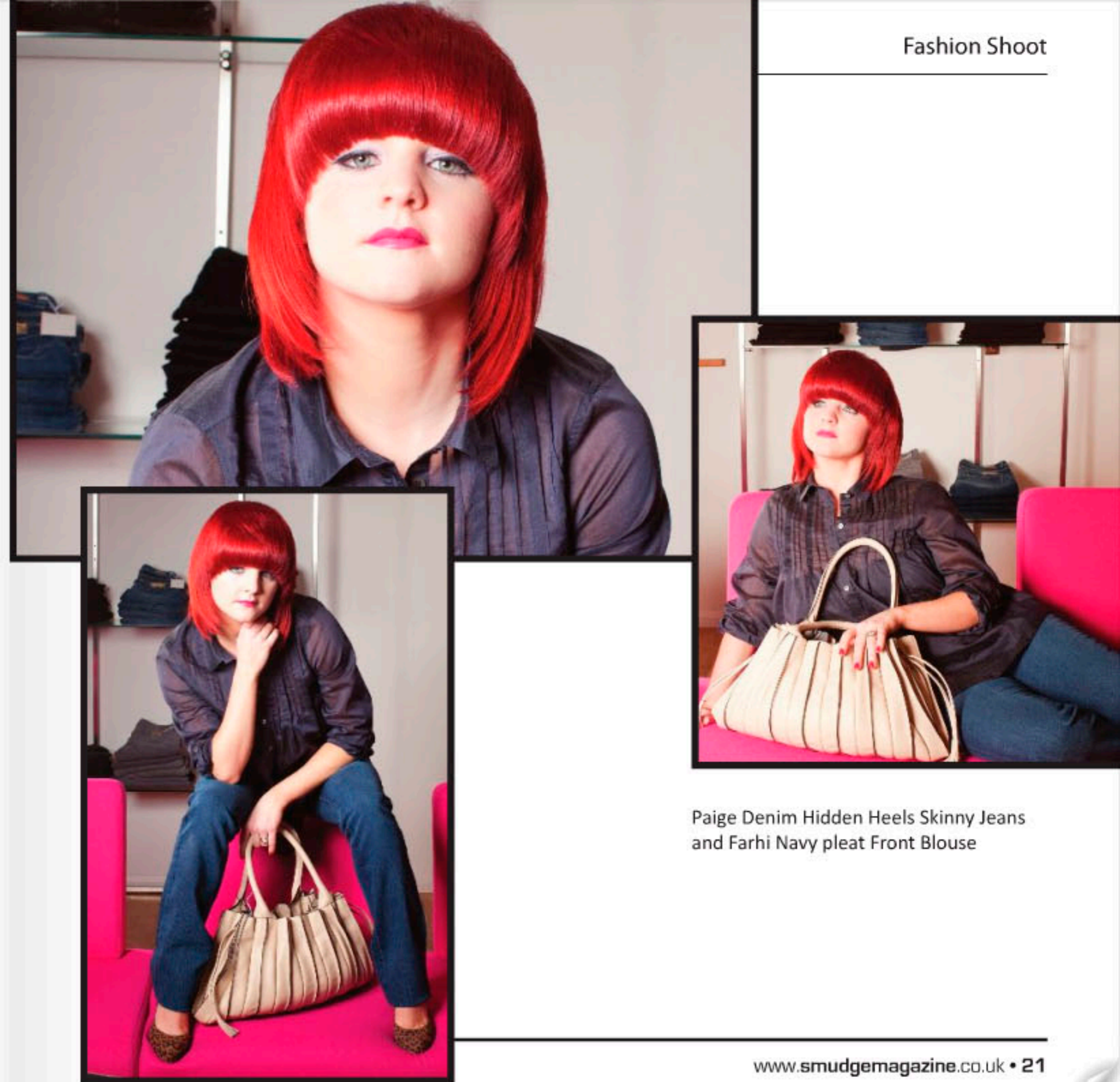
Paige Denim Hidden Heels Skinny Jeans and Farhi Navy pleat Front Blouse