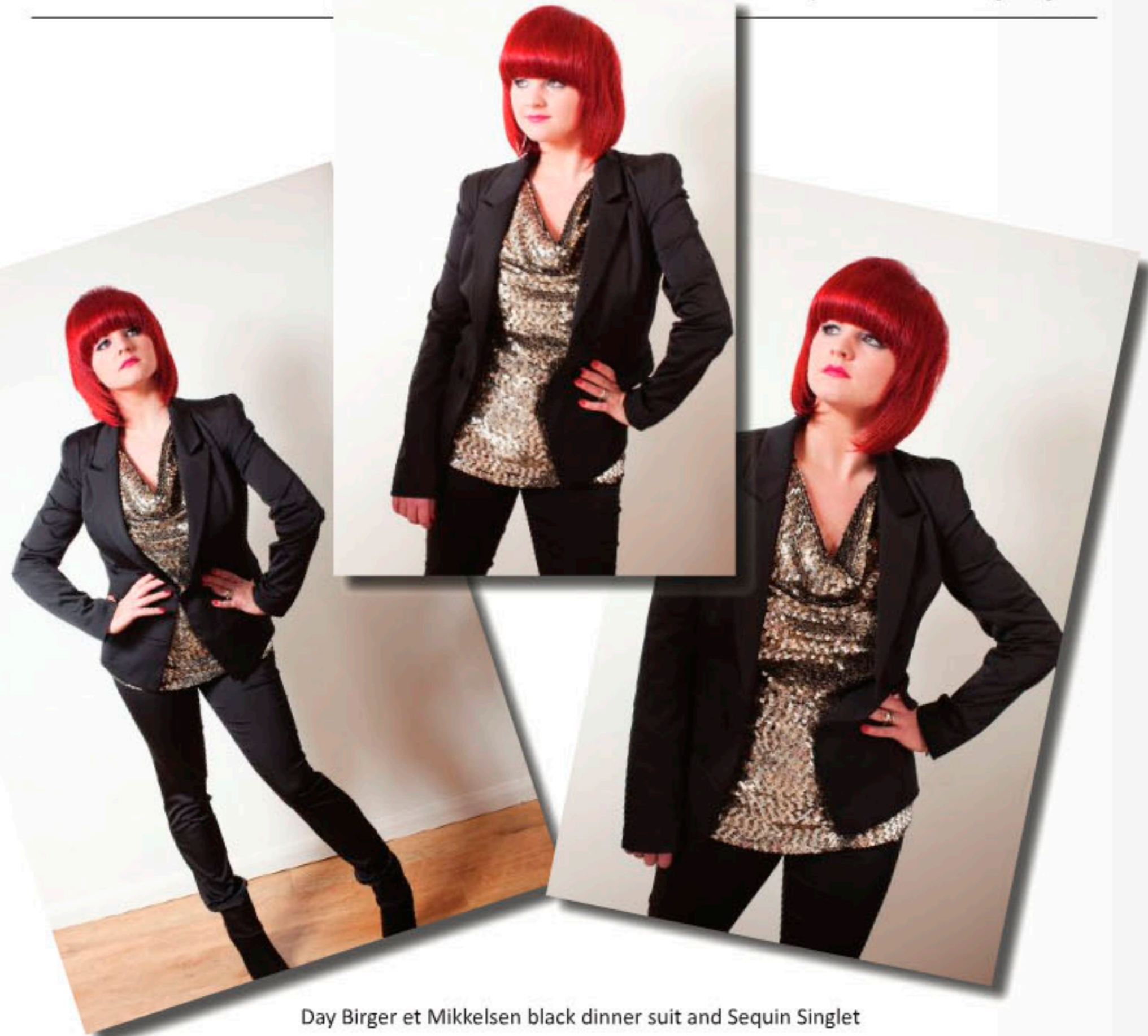
Day Birger et Mikkelsen black dinner suit and Sequin Singlet