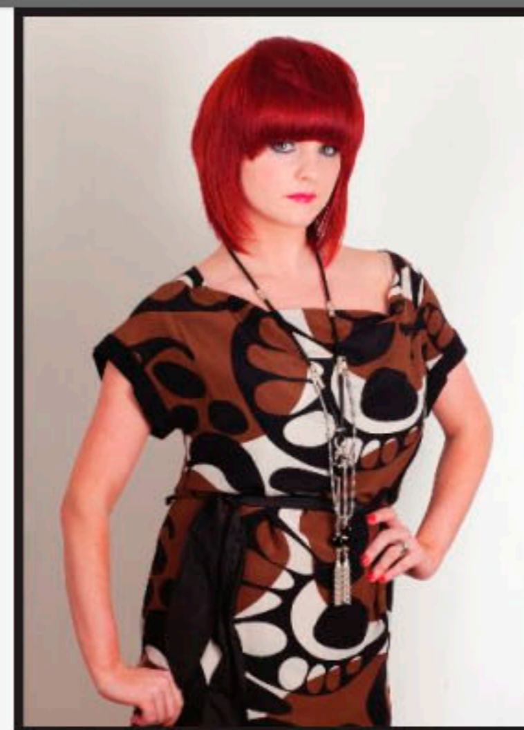
Farhi Silk Paisley Dress